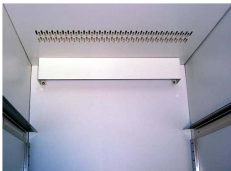
Drw. 2 – ceiling with block cooling unit