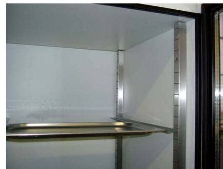
Drw. 3 –Example of internal accessories