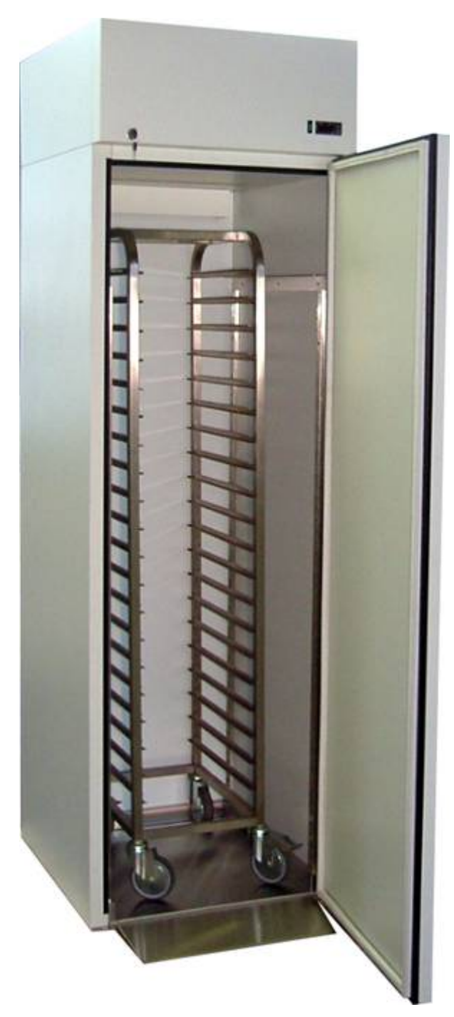
Cabinet KOMBI 1 – drive-in version