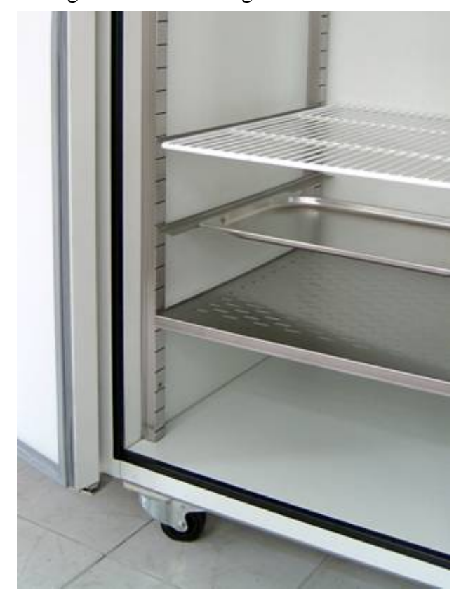
Example of internal accessories.